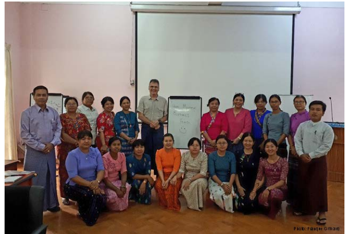
Photo: The Upper Myanmar Economics Team at the University of Mandalay

workshops and continuous support to the University of Mandalay as well as the Myanmar Development Institute (MDI) in Nay Pyi Taw. Expanding the research and analytical capacity of these stakeholders requires offering a targeted approach to take into account the differences emanating from their mandates, roles and nature.