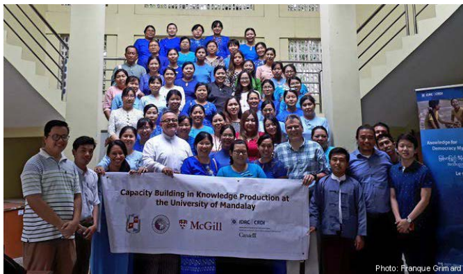
Photo: Capacity Building in Knowledge Production at the University of Mandalay

As part of this program, ISID members will participate in two projects for the next three years. The first project is on supporting capacity building for researchers and policy analysts in Myanmar and the second one is a research project on understanding Barriers and Working Pathways to Women's Political Participation in Myanmar .